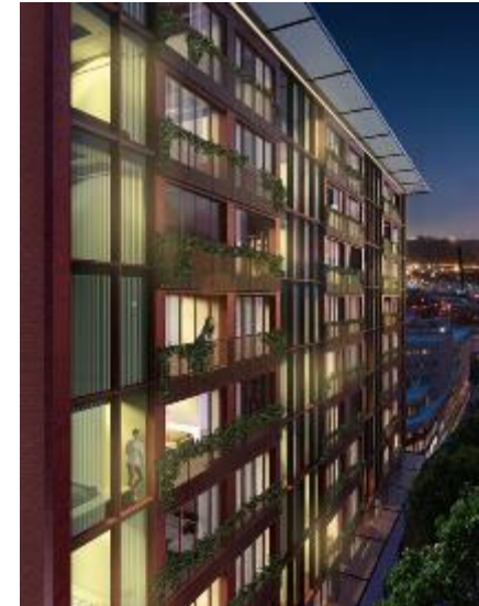
Trinity Expected completion: Winter 2021

Residential development in downtown El Paso, adaptive reuse of existing office building on streetcar route.