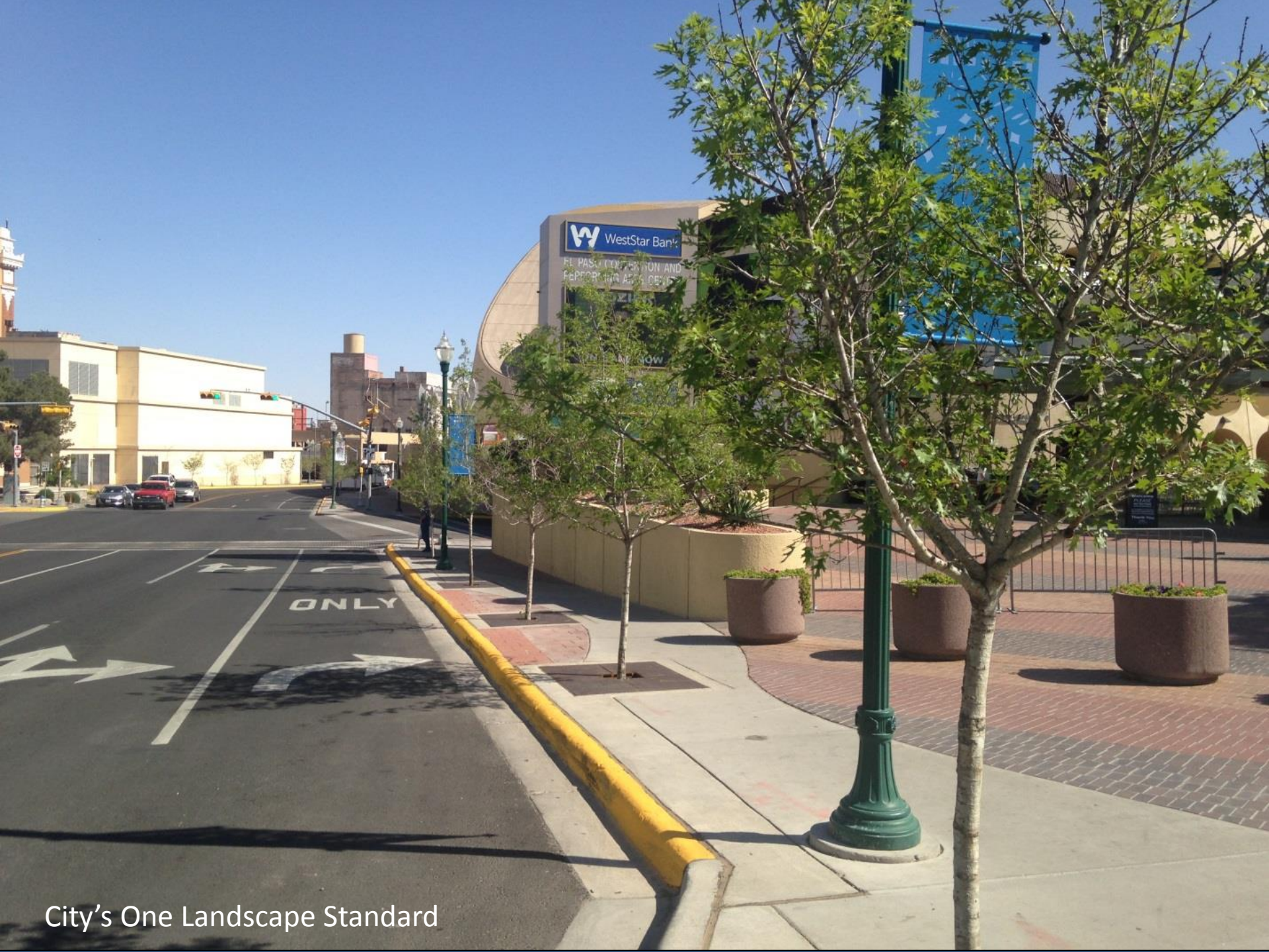
City's One Landscape Standard